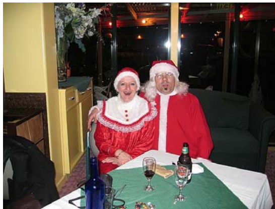
Mr & Mrs Claus

Director's Quote: Love is blind, but marriage is a real eye-opener.